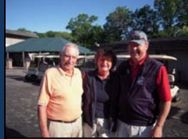
THE SPIRIT OF FRIENDSHIP GOLF OUTING FUNDRAISER