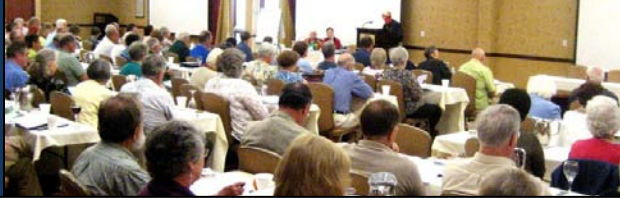
MUTUAL GATHERINGS, BUILDING RELATIONSHIPS FORMATION, TRAINING SESSIONS-WORSHOPS