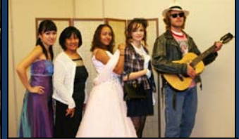
SOLIDARITY IN OUR STORES LUNCHEON FASHION SHOW